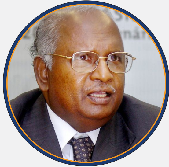
Hon'ble Mr. Justice K.G. Balakrishnan Former Chief Justice of India

My best wishes for Law Joint. It is always heartening to note that a new platform is created for legal fraternity to improve the knowledge and professional skill. My cooperation will always be there.