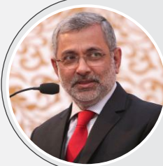
Hon'ble Mr. Justice Kurian Joseph Former Judge Supreme Court of India